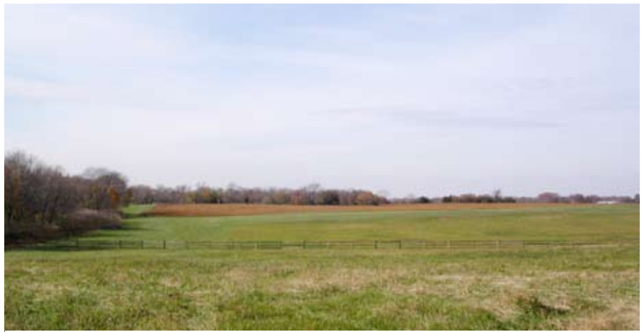
Seabrook farm field

Part of the Seabrook lands overlook the 18,593-acre area known as Mannington Meadows, bounded by the Salem River and the Mannington Creek. Historically, the Meadows were diked by Dutch settlers who farmed salt hay and wild rice. A 1920s hurricane destroyed most of the impoundments, which were never rebuilt. The resulting land and waterscape, neither a lake nor a bay, is one of the top areas in the state of New Jersey for waterfowl diversity. Mannington Meadows provides critical habitat for breeding