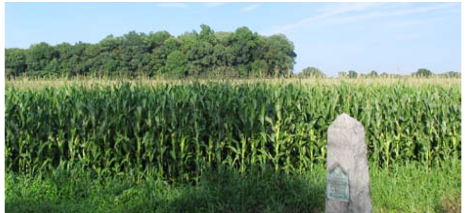
This stone monument, located along Quaker Road on the Institute Lands, stands opposite the 16.5 acre property along the Stony Brook about to be preserved by D&R Greenway. It commemorates the route taken by General George Washington's army to the battle of Princeton.

This historic location on the Stony Brook is identified by a stone pillar along Quaker Road, adjacent to the 589-acre Institute Lands, preserved by D&R Greenway and partners in 1997. The 16.5 acres immediately opposite this marker will be preserved by D&R