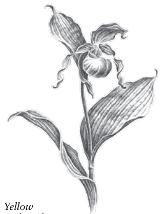
Yellow Lady's Slipper ( Cypripedium calceolus )