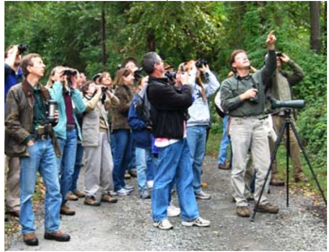
David Allen Sibley, noted author and illustrator of The Sibley Guide to Birds, visited D&R Greenway in October 2008. Here he leads a group of D&R Greenway supporters on a walk through the Hamilton-Trenton-Bordentown Marsh. Mr. Sibley is pointing towards the sky at right of picture.